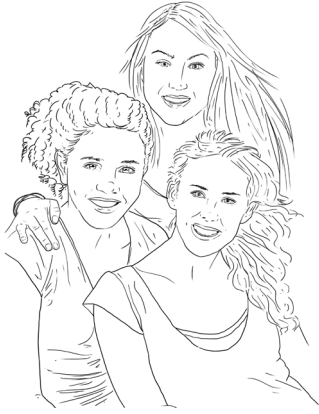
The Three Amigos