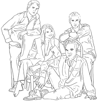
The Group of Four