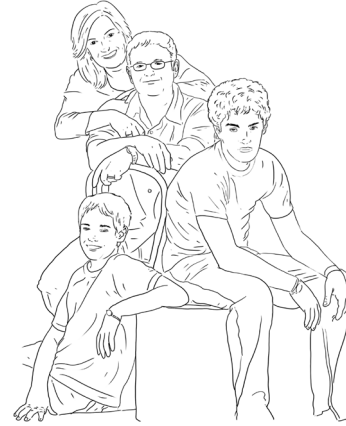
The Chilled Family

A printable from Digital Photography School. Portraits Posing Guide for Women. All photos and text ©Digital Photography School Poses taken from the eBook Portraits – Striking The Pose. www.digital-photography- school/printables