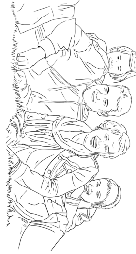
The Fun Family