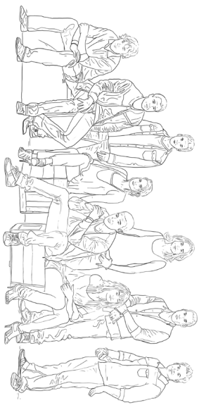
The Large Group