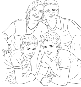
The Family Picnic