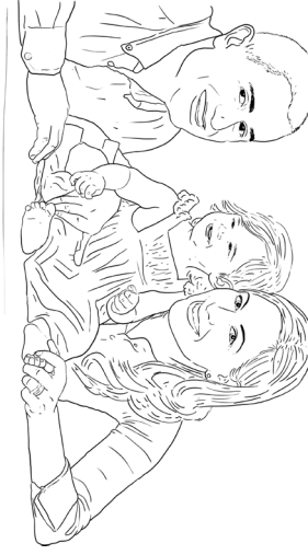
The Table Tot