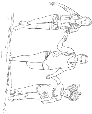
The Hills are Alive