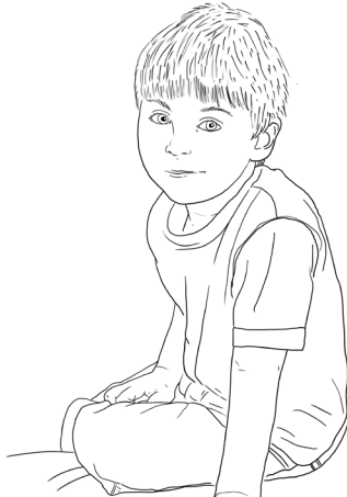
The Arm Lean