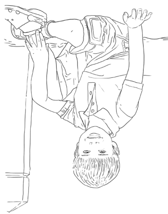
The Sit and Play