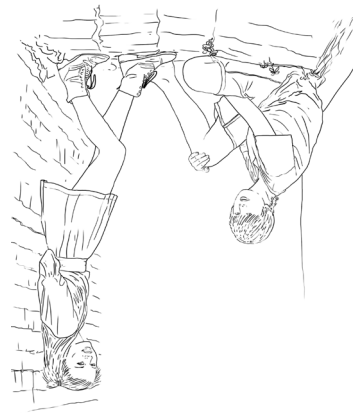
The Alley Way