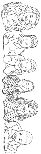
The Elbow Rest