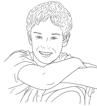
The Chair Hold

A printable from Digital Photography School. Portraits Posing Guide for Women. Poses taken from the eBook Portraits – Striking The Pose. www.digital-photography-school/printables