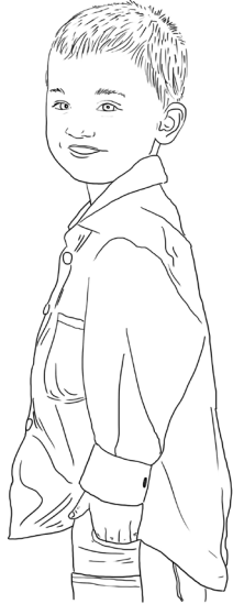
The Big Boy