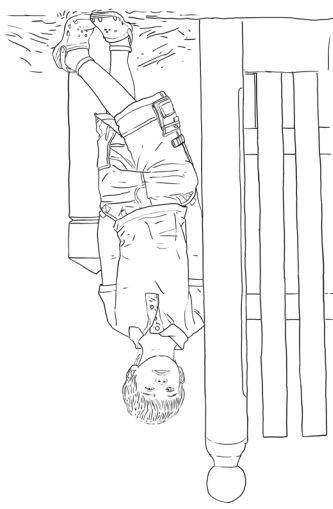
The Lamp Post