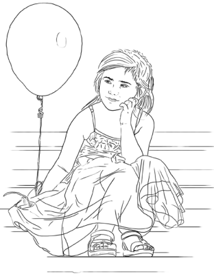
The Stair Seat