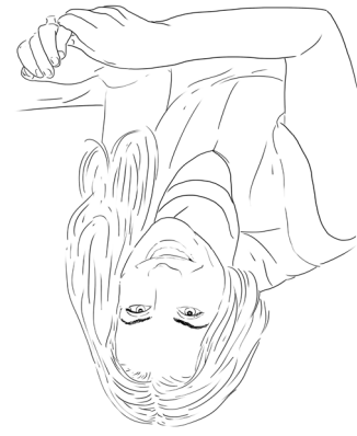
The Lean Forward