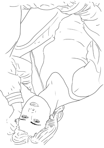
The Lifestyle Pose