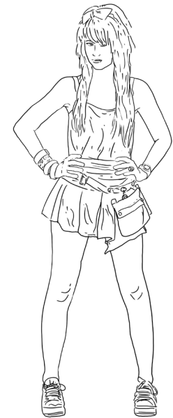
The Wonder Woman

A printable from Digital Photography School. Portraits Posing Guide for Women. Poses taken from the ebook Portraits – Striking The Pose. www.digital-photography-school/printables