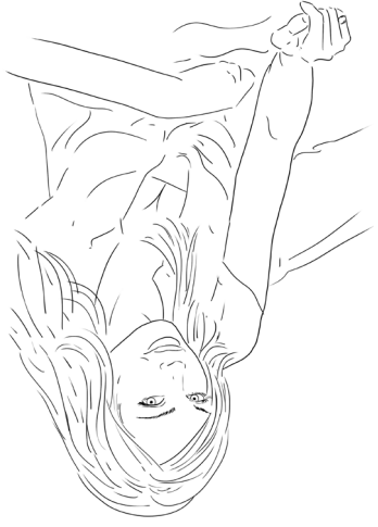
The Lay Down Sally