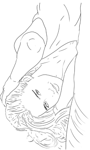
The Hair Rub