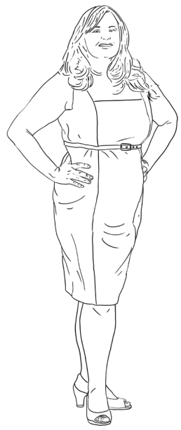
The 3/4 Twist