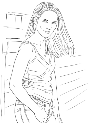
The Wall Lean