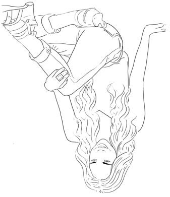
The Relax Back