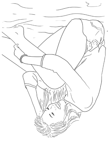
The Sit Tight