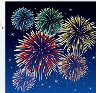
2" Long Exposure, Fireworks