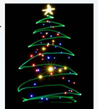
5"-10" Light Painting, Stars, Milky Effect on Moving Water