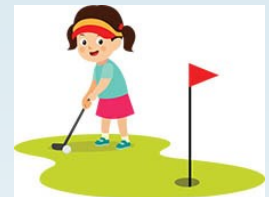
1/500 People Running or Slow Moving Sports