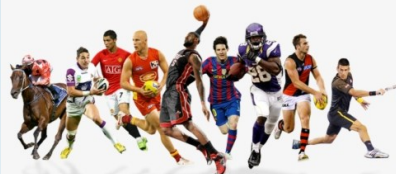
1/1000 Fast Movement, Sports