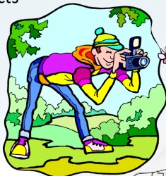
1/125 Everyday Photos