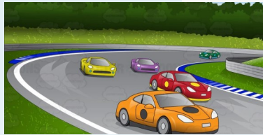
1/2000 Cars Racing