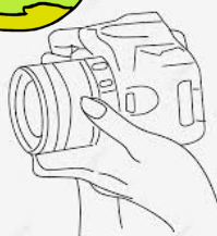
1/60 Slowest Handheld Setting for Sharp Images