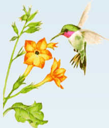
1/4000 Very Fast Moving Objects