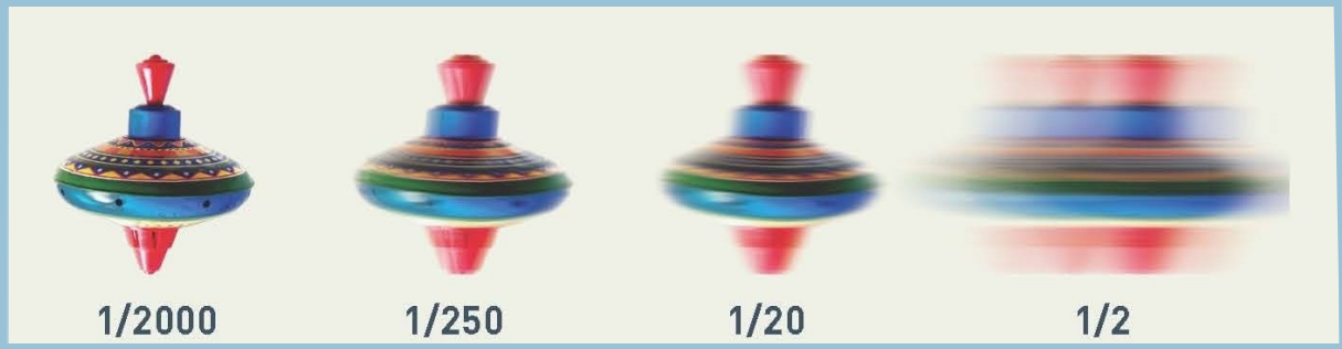
Motion Blur demonstrated by differing shutter speeds